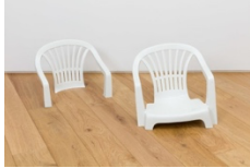
James Lomax Chair Study (for a sinking city) , 2024 Left: 32 x 55 x 39 cm Right: 39 x 55 x 42 cm