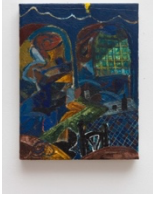
Elias Peña Salvador Farewell at Dawn , 2024 Oil on Linen 24 x 18 cm (SEP002)