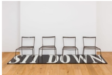
Franz West Untitled (Sit Down) , 1996 – 2003 4 metal chairs, wooden board and lacquer (8 parts) Chairs: 77 x 63 x 42 cm Board: 347 x 80 cm (WF001)