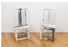
Ai Weiwei Marble Chairs , 2008 Marble 120 x 52 x 46 cm (each) (AW001)