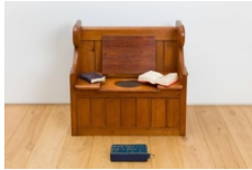
Alma Berrow Take a Pew , 2024 Earthenware and wood Pew: 48 x 91 x 86 cm Cushion: 14 x 26 x 6 cm Open book: 20 x 27 x 5 cm Closed book: 19 x 13 x 3 cm (AB081)