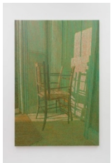
Marco Bizzarri Apertura III , 2024 Oil and acrylic on canvas 120 x 180 cm (BM001)