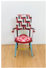
Christabel MacGreevy Patchwork Rework (Herbert George Wainwright) , 2024 Mixed Media 45 x 45 x 100 cm (CM 067)