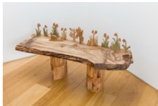
Emma Sheehy Love Bench Beech, oak, pigments and varnish 139 x 45 x 38 cm (SE003)