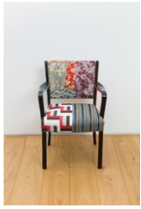
Christabel MacGreevy Patchwork Rework II , 2024 Mixed Media 51 x 50 x 84 cm (CM 068)