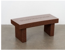
Jenny Holzer Survival: Bodies lie in the bright grass... , 1989 Indian red granite bench Ed. 1/2 + 1AP 43.2 x 106.7 x 45.7 cm (HJ001)