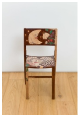
Orfeo Tagiuri The tree of all potentials , 2024 Ink and wood stain on Chapel chair 81 x 44 x 38 cm (TO002)